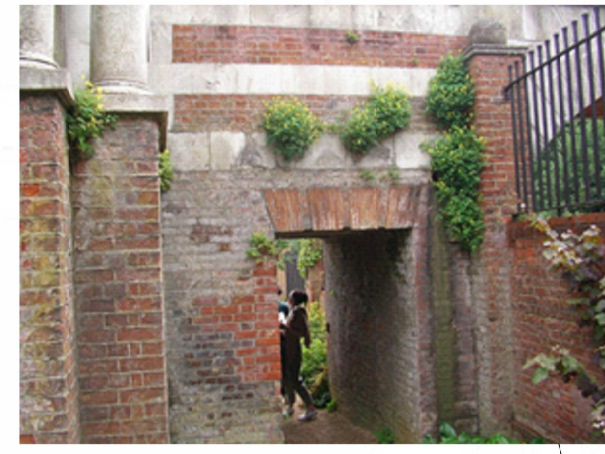
Bridge over footpath